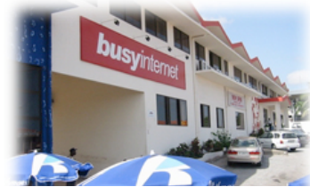
Busy Internet building in Accra which also houses Ecoband Networks the resale agent of IP Planet.

VSAT operators in Ghana would like to see the NCA and the Ministry of Communications differentiating between operators of big medium and small size. Given that the traffic capacity of satellite dishes vary depending on their bandwidth, the licenses, and annual fees charged on them could be made to reflect such differences. Government imposed costs are a major draw back in the attempt to provide Internet services to Ghanaian and other African communities.