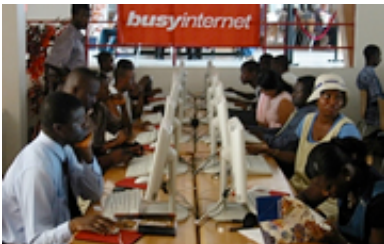
A section of the Cyber café at Busy Internet’s business center in Accra.

Prior to September 2003 Busy Internet’s traditional services to Ghanaians had